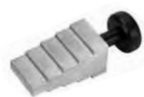
Aluminium Safety Block CY15B as option.